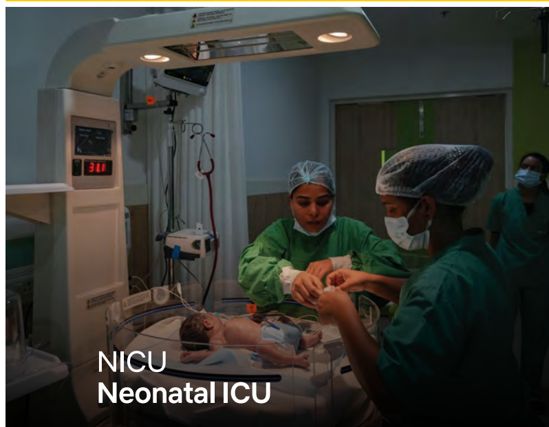
NICU Neonatal ICU

ACLS and BLS ambulances equipped with an EMT are available across the city, 24X7, in addition to which the hospital boasts of the best team of dedicated Emergency Doctors manning the Emergency 24X7