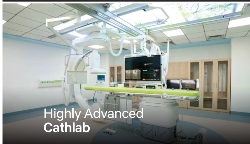
Highly Advanced Cathlab