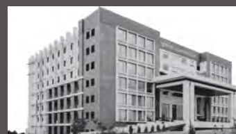
Graphic Era Institute of Medical Sciences

Graphic Era Global School founded in August 2016, offers quality education with a focus on academics, technology, and holistic development.