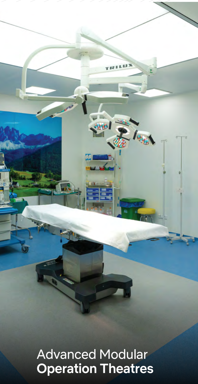
Advanced Modular Operation Theatres