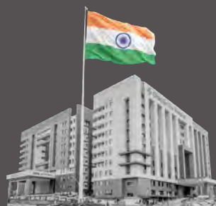
Graphic Era Hospital