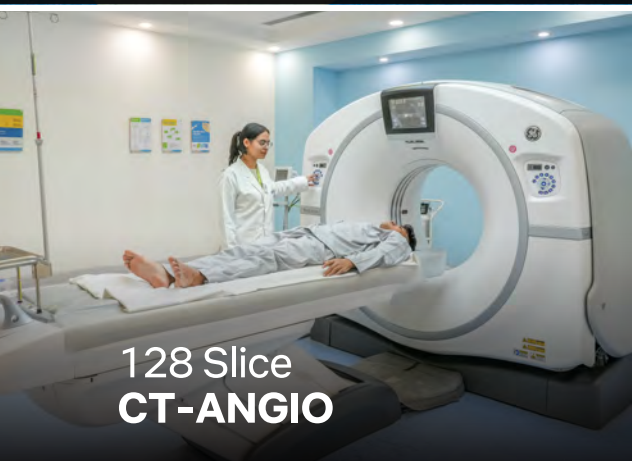
128 Slice CT-ANGIO